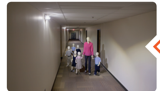
Quantum® ELMLT unit at one and 90 minutes