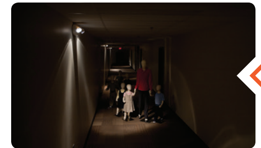
Typical unit at 90 minutes