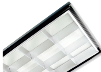
18 CELL PARABOLIC